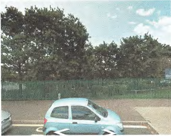
LOCATION A WITHOUT POLE