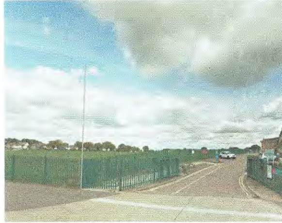
LOCATION B WITH POLE