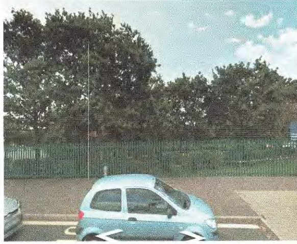
LOCATION A WITH POLE