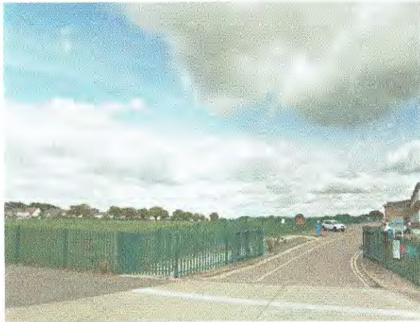
LOCATION B WITHOUT POLE